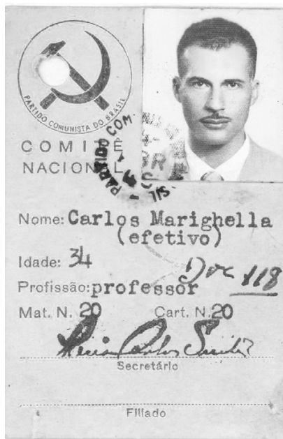
Marighella's PCB card, 1945.